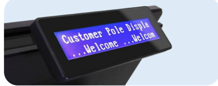
LCM Customer Display