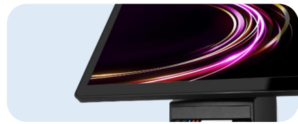
Flat Touch Screen